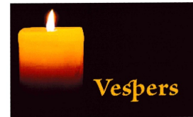
VESPERS AT OLD SHIP

90 main street Hingham, Ma. 6:00 Wednesdays Nov 29 Dec 6, & 13th longer sleeping back into light. A candle lit in church, casting shadows hundreds of years old, and a half-hour of listening and being. We hear words of peace and comfort, words that lift us, and silence that invites our inner thoughts as we listen to the softly of this ancient Meeting house. Join us for this time of self reflection. All are welcome at Old Ship's 1st Parish, Hingham