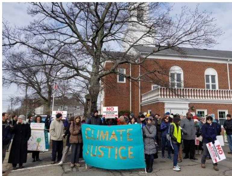
Interfaith Gathering, Quincy Point Congregational Church, 2/27/20

UUMassAction, Mass. Environmental Ministries of the United Church of Christ, Southern New England Conference, and Boston Catholic Climate Movement. Speakers re-iterated the environmental objections that had been raised for many months, adding, “We believe that stopping this project is an urgent matter of climate justice for people of faith and for all people of good will.”