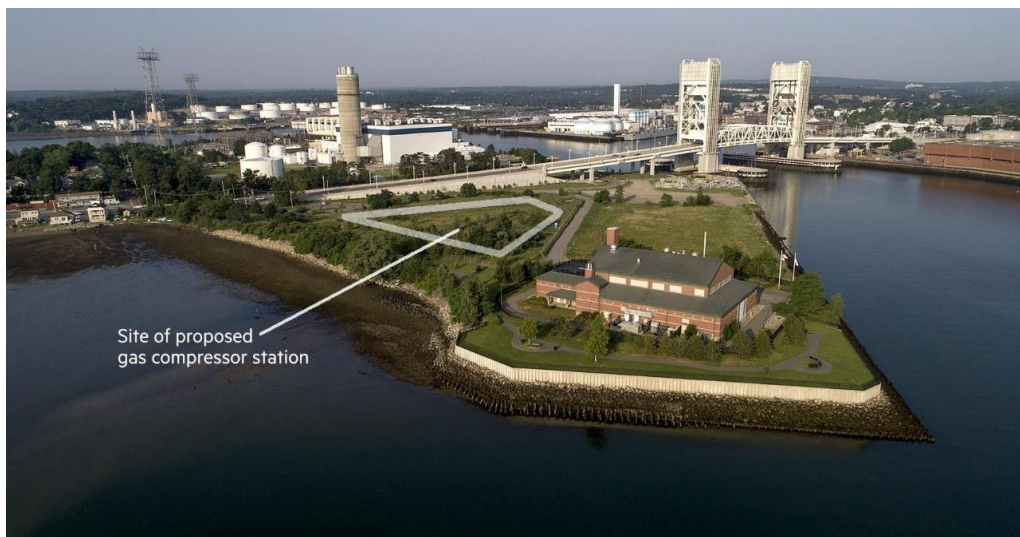
Compressor station site directly abutting the Fore River bridge between Weymouth and Quincy

The compressor station fight is also a question of environmental justice. The plan places a very dangerous industrial facility in a densely-populated, working class Weymouth neighborhood, one already over-burdened with polluting industrial facilities. The fumes from the station would blow directly over the poorest section of neighboring Quincy. The compressor station presents multiple challenges to public health and safety including increased air and noise pollution, risk of explosion (which has happened elsewhere), exposure of toxic materials in the ground during excavation, and interference with an existing conservation area.