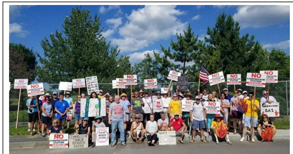
Rallying at the site