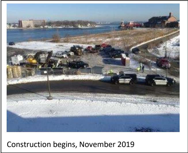
Construction begins, November 2019

When in November of 2019 Enbridge was finally granted the Notice to Proceed (NTP) with construction on the compressor station by the Federal Energy Regulatory Commission, FRACCS and 350 MA stepped up their resistance again.